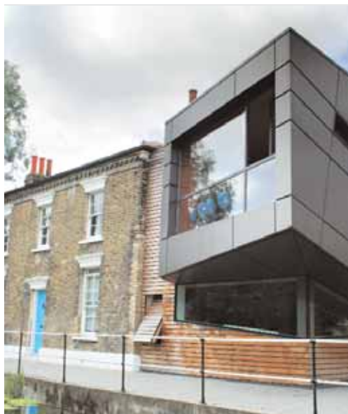
Lock-keepers Cottage Graduate Centre