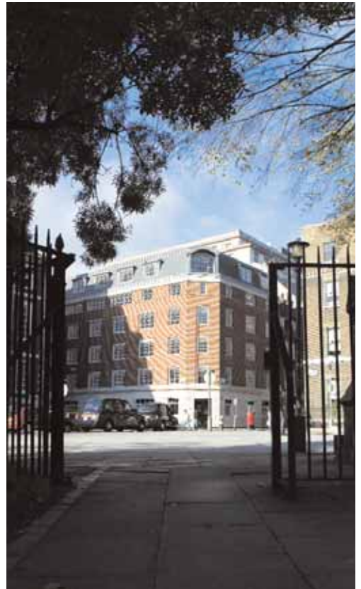
Postgraduate Law Building, Lincoln's Inn Fields, Holborn

With over 700 postgraduate students from all over the world, Queen Mary is one of the biggest providers of Research Programmes in Law in the country. It is the only University in London to offer a MA Research in Law. In participating in the MA by Research degree at Queen Mary, you will be part of a cosmopolitan community, which includes students from all over the world, who have come to Queen Mary to undertake research.